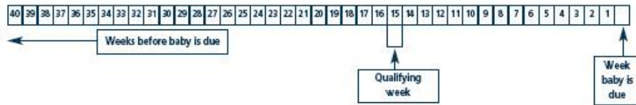
Diagram showing the qualifying week

The diagram below shows how to identify the "Qualifying Week".